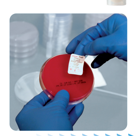
Place the label from the pouch onto the culture medium.