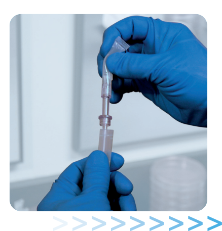
With the applicator at a slight angle to the vial, squeeze the ampoule dispensing the hydration fluid into vial. Then re-insert applicator into vial and gently mix from side-to-side. Do not invert.