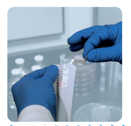
Tear open foil pouch at notch and remove device. Remove label from the outside of the pouch.