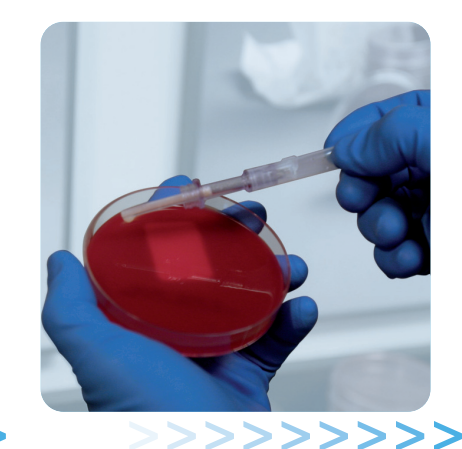
Using ampoule as a transfer pipette, place two drops of resulting suspension on culture medium.